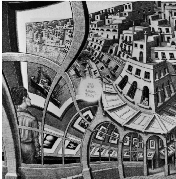
All M. C. Escher works © 2002 Cordon Art – Baarn – Holland. All rights reserved. Used by permission. http://www.mcescher.com

The common denominator of all blind spots may be the fact that one is (so to speak) captured by one's own model. 11 This is expressed very clearly in Escher's picture gallery: